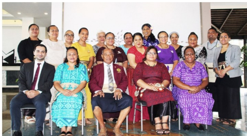
Above: The Hon. Acting Prime Minister with members of Tonga's UPR Working Group and development partners.

A three (3) -days Write-Shop was held on the 16th - 18th January, 2023 at the Tano'a International Hotel to provide technical support for Tonga's UPR Working Group (WG) on the drafting of Tonga's fourth national report. This event provided an opportunity for the UPR WG stakeholders to reflect on the UPR reporting process, discuss key challenges, past achievements and progress in light of the Hunga-Tonga Hunga Ha'apai volcanic eruption and tsunami, in addition to the COVID-19 pandemic. The Write-Shop was successfully launched by the then Hon. Acting Prime Minister and Minister of Justice - Samiu K. Vaipulu.