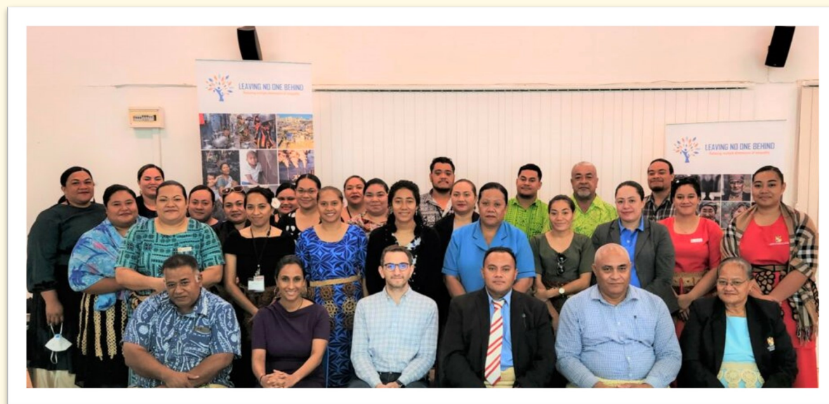
Participants from various ministries at the opening of the Leave No One Behind Technical R-Training