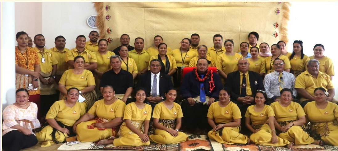
The Honorable Prime Minister Hu'akavameiliku with the new ap- pointed Govern- ment Statistician and staff after the morning prayer in the Tonga Statistics Department