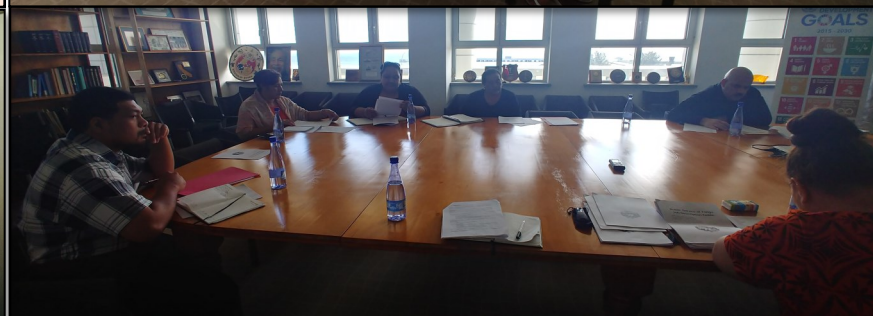
Further Job Description consultation with MFA on 25 November