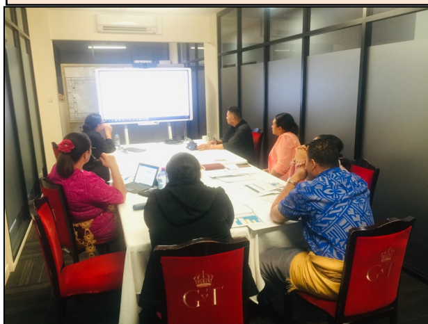
PSC Job Evaluation Team (JET)