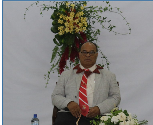
Guest of Honour: Hon Prime Minister Pohiva Tu'lonetoa