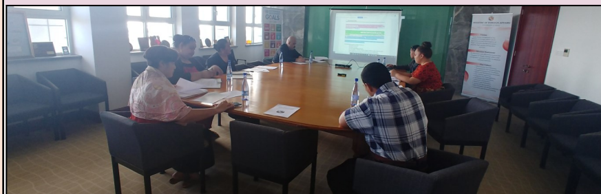
Further Job Description consultation with MFA on 25 November