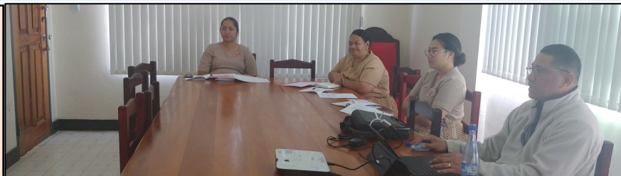
Job Description Training for MOJ on 16 November 2020