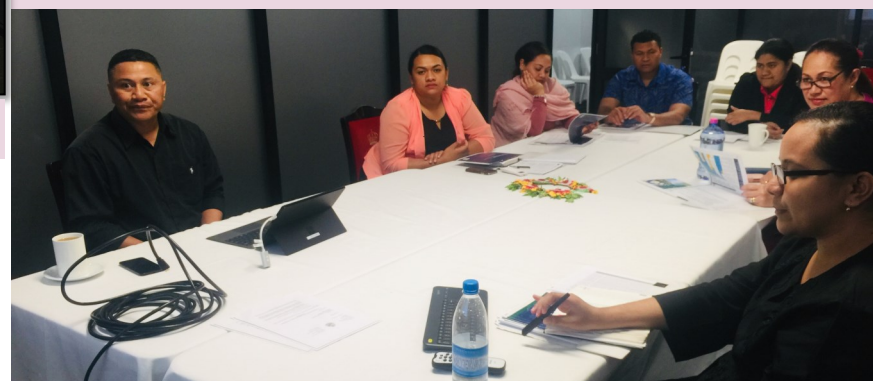
PSC Job Evaluation Team (JET)

For more information please contact Remuneration Division @ remuneration@psc.gov.to