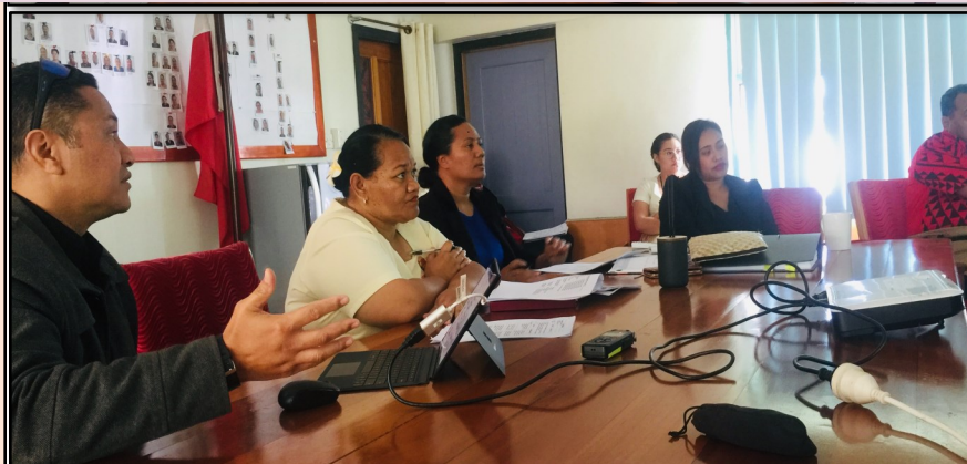
Job Description Training for MOJ on 16 November 2020