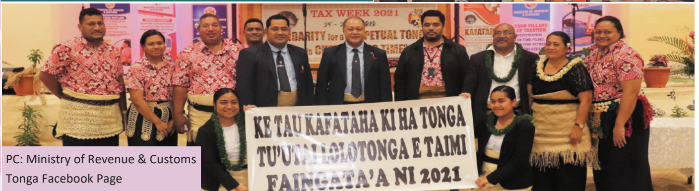
PC: Ministry of Revenue & Customs Tonga Facebook Page