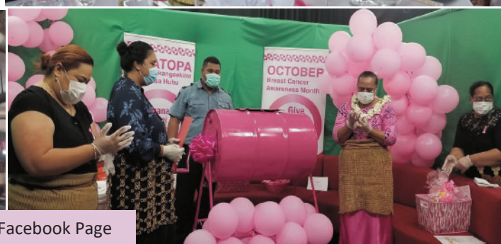
PC: Tonga Breast Cancer Society Facebook Page