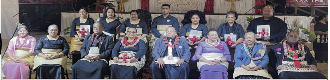
Hon Minister, MET staff and family representatives to receive appreciation certificates of those who had passed away in 2021.