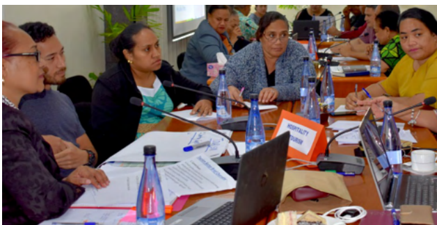
Hospitality and Tourism Industry Team during group discussion