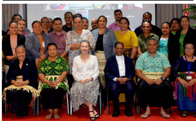
TVET Change Happens Workshop facilitators and participants