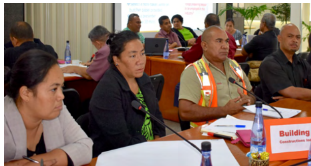
Building & Construction Industry Team during the TVET Workshop