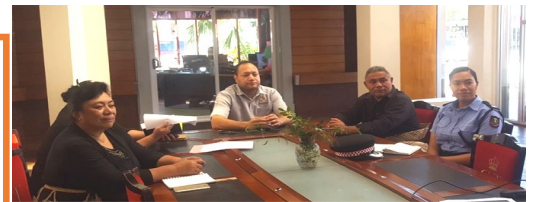
Above & Below: PMS Managers during a PMS Sub-Committee Meeting on 20 July

Dissemination of Line Ministries PMS Quarterly Feedbacks for April—June quarter.