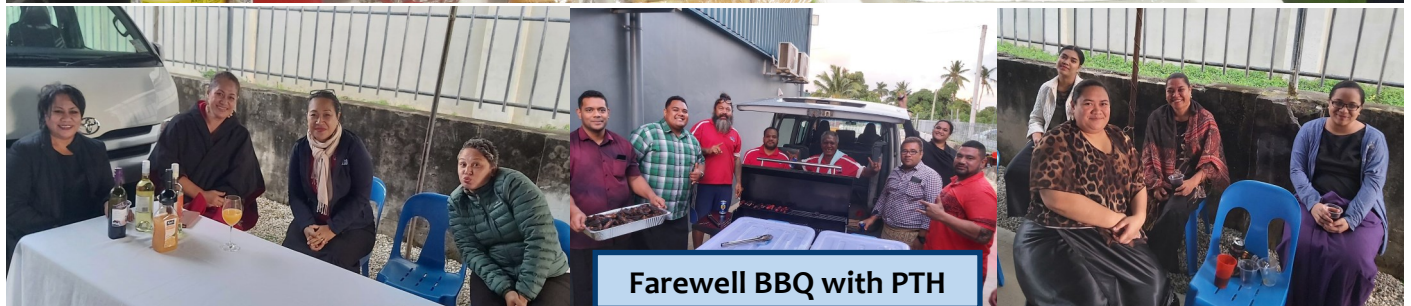
Farewell BBQ with PTH