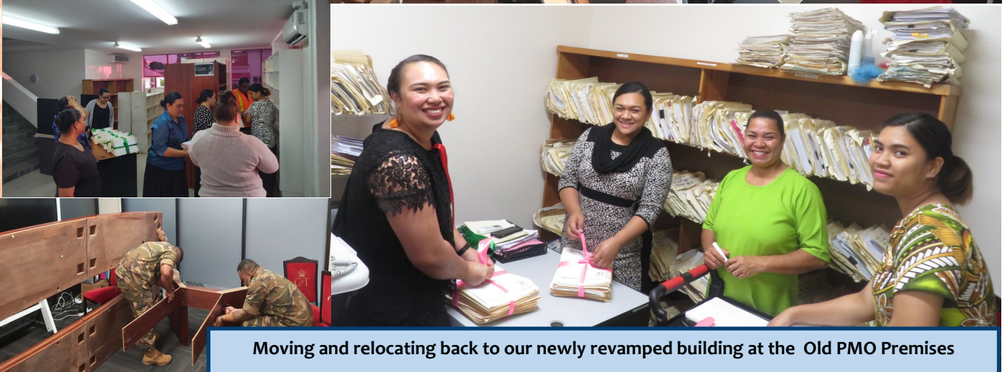
Moving and relocating back to our newly revamped building at the Old PMO Premises