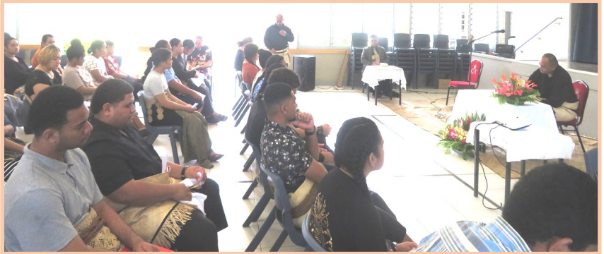
Above: Hon. Hu'akavameiliku key note address to Government of Tonga scholarship recipients

The scholarship process was clearly explained to the participants– the types of scholarship offered and the requirements from TNQAB.