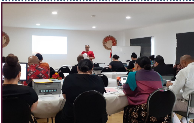
AS Latu, and AS Fifta: JD Training with MOH