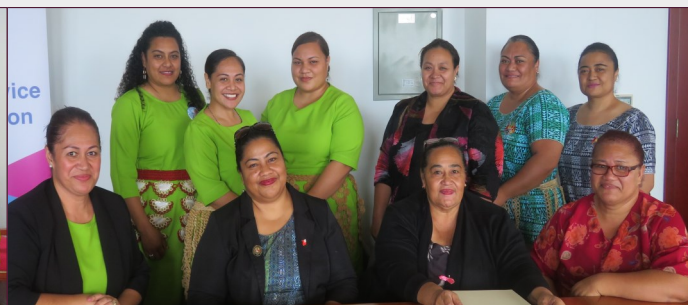
Ministry of Foreign Affairs

PSC Mission: “To deliver quality services with passion, integrity and efficiency in enabling platforms” PSC Vision: “To be a trusted, respected and internationally reputed Public Service”