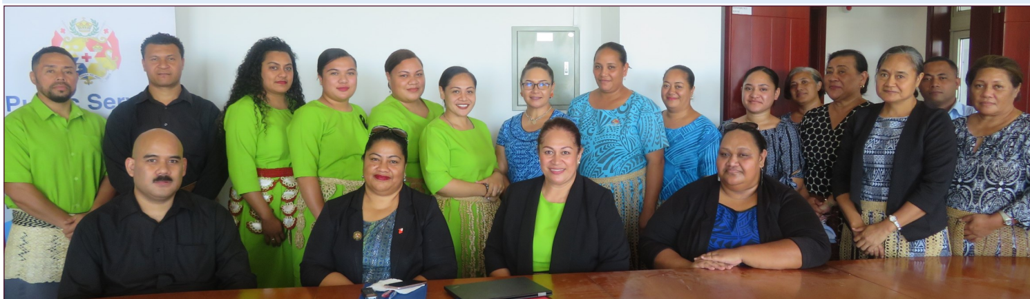
Ministry of Foreign Affairs

The PSC Talatalanoa program was successfully conducted to all the Line Ministries at ‘Eua on the 2nd– 3rd March, 2021, the Palace Office on the 08 April, 2021, and the Ministry of Foreign Affairs on 22 April, 2021. This is an important program which allows the PSC Office to present and discuss with the employees of all Government Ministries, new policies and policies and instructions that needs reminding and clarification. This is crucial so that the Public Service have the same understanding of policies and instructions such as the Code of Ethics and Conduct for the Public Service 2010, Social Media Guideline 2020 and revised policies and instructions. The staff were also able to capture concerns and issues from the employees for our necessary actions to ensure that the Public Service is able to deliver their core functions effectively and efficiently. The PSC Office wishes to extend its gratitude to all Line Ministries for welcoming us and for their warm hospitality. The Talatalanoa Program was a success because of your willingness to take part and freely share with us your concerns, recommendations and success stories.