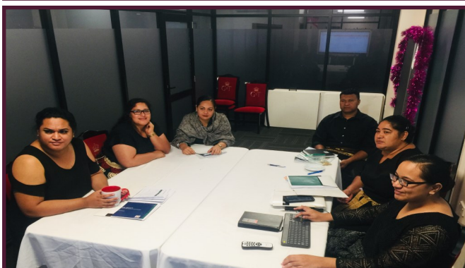
PSC-JET : Evaluation of positions