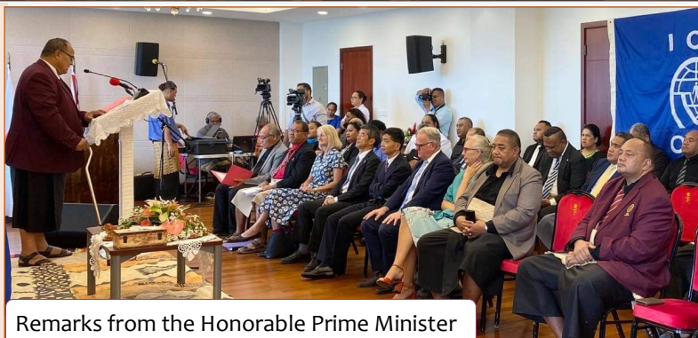
Remarks from the Honorable Prime Minister

On Wednesday 28 April 2021 the Honorable Prime Minister, Hon. Dr. Rev. Pohiva Tu'i'oneota officially launched Tonga's Migration and Sustainable Development Policy (MSDP) at the Ministry of Foreign Affairs, St. George Building, Nuku'alofa. The event was attended by Cabinet Ministers, Hon. Hu'akavameiliku and Hon. Tatafu Moeaki, members of the Diplomatic Corps, Chief Executive Officers and distinguished guests. Ministry of Foreign Affairs in partnership with the International Organization for Migration implemented the MSDP aiming to provide Tonga's stakeholders an evidence based framework which is the beginning of an ongoing process in strengthening a migration strategy for sustainable development.